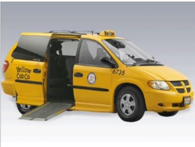
LA Yellow Cab Website, 2016