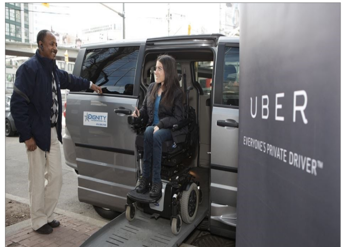
Uber Newsroom, 2016